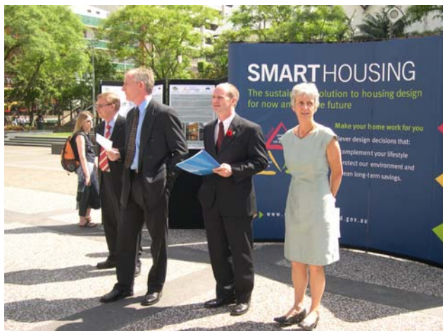
Sustainable Home Brisbane – Official Launch