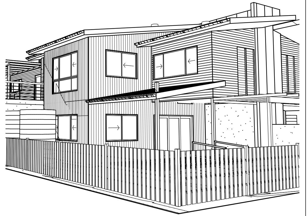
PERSPECTIVE VIEW FROM NORTH WEST