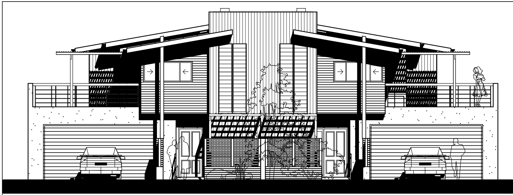
EASTERN ELEVATION 1:100